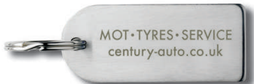
* Laser Engraving Opposite Side