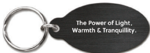
* Laser Engraving Opposite Side