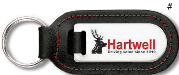
Die Stamped & Colour Filled