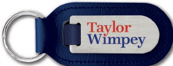
Die Stamped & Colour Filled