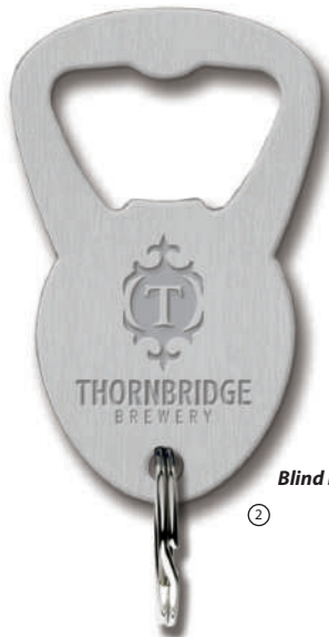
Blind Die Stamped