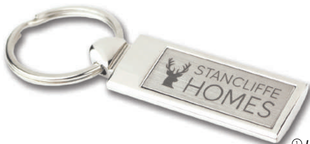
① Laser Engraved