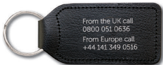
* Foil blocking opposite side