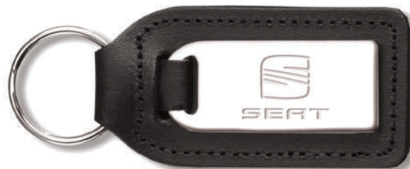
Blind Die Stamped