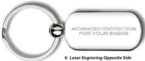
* Laser Engraving Opposite Side