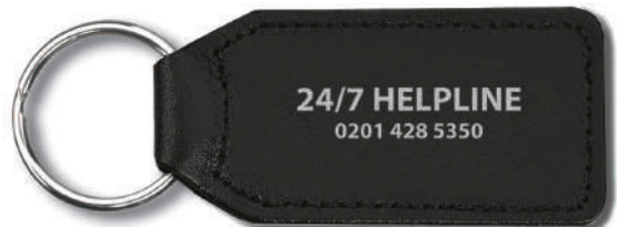
* Foil blocking opposite side