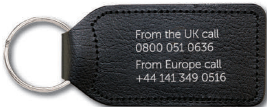
* Foil blocking opposite side