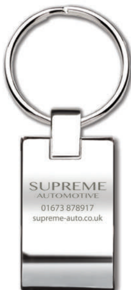
* Laser Engraving Opposite Side