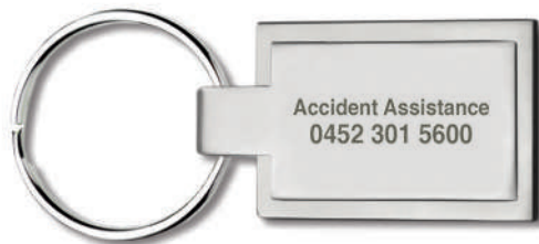
* Laser Engraving Opposite Side