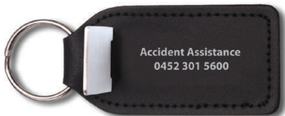
* Foil blocking under medallion