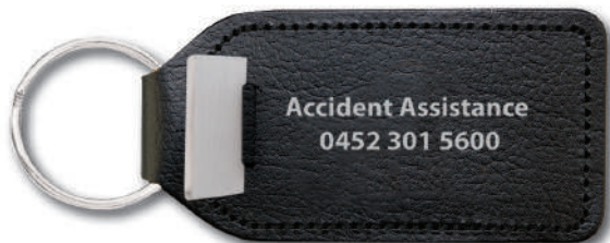
* Foil blocking under medallion