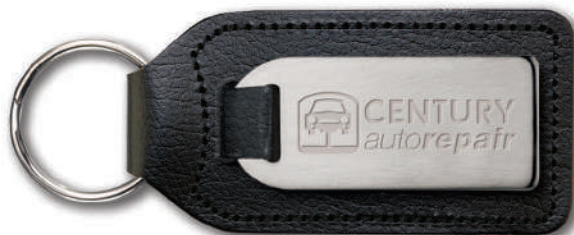
Blind Die Stamped