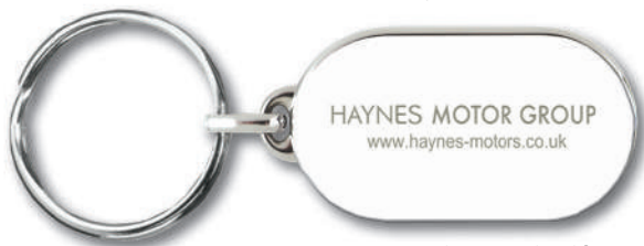
* Laser Engraving Opposite Side