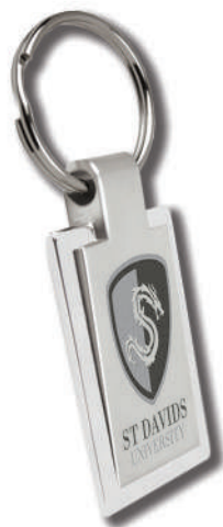
Multi-Tone Laser Engraved