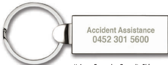
* Laser Engraving Opposite Side