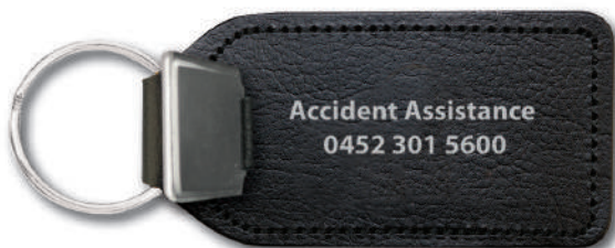
* Foil blocking under medallion